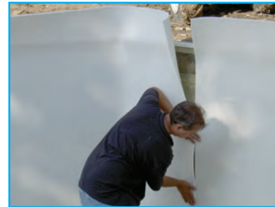
Stage 5 Fit underlay and cut in pool fittings