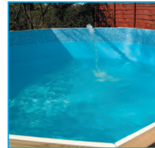
Stage 6 Liner fitted ready for filling