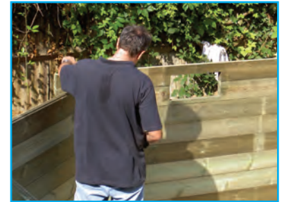
Stage 4 Finished wooden shell