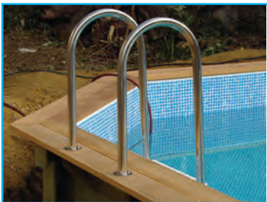
Stage 7 Top rail and internal ladder fitted