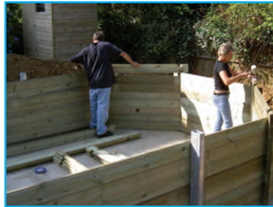
Stage 3 Building walls to correct height