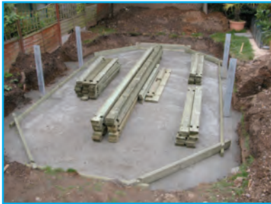
Stage 2 Layout and square first timber layers