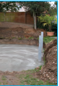
Stage 1 Concrete base