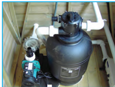
Stage 8 Filter package connected to pool