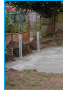
Stage 2 Lay concrete